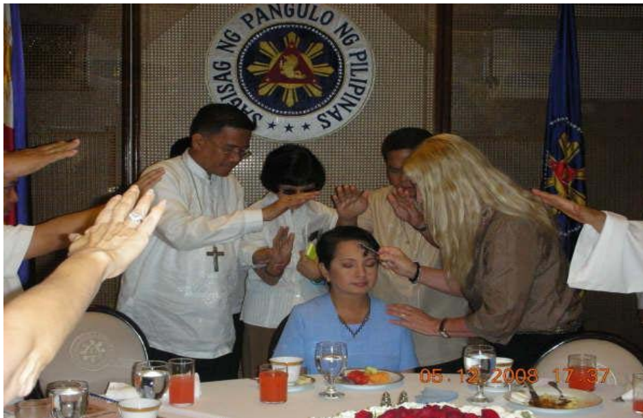
Praying over the President with the Bishops