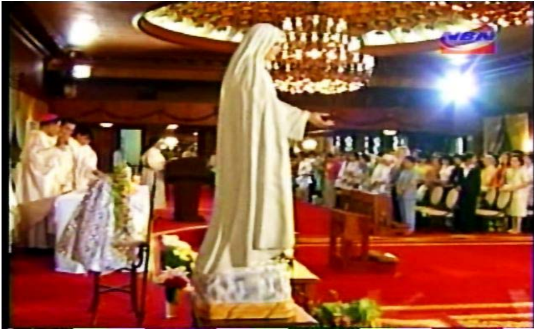
In the Palace, during the Holy Mass in honor of Our Lady of Fatima