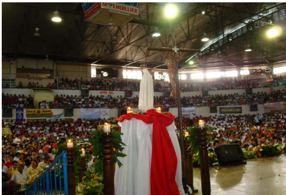
Our Lady of Fatima in the midst of the celebration