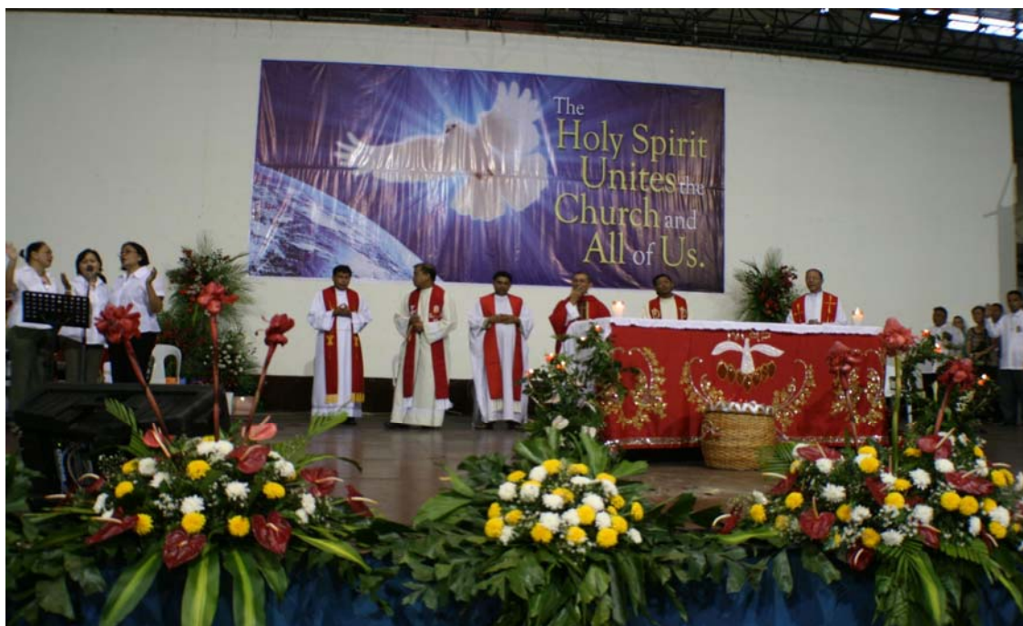
Before the Holy Mass

steadily, gushing till it becomes a river to renew us, to renew the Church...we are the New Jerusalem, the City of God that is being renewed, that will come like a beautiful bride in the sky after having been purified by the Holy Spirit. The New Heavens, the New Earth, the New Jerusalem, through the Holy Spirit!"