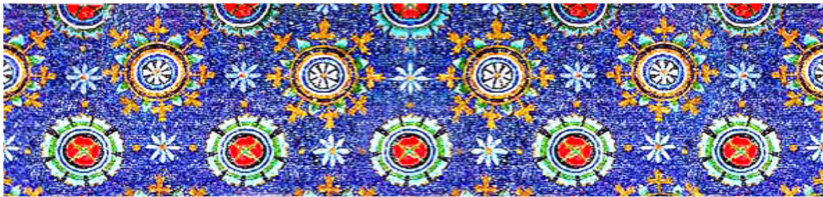
Byzantine ceiling mosaic: "Theological Thought"