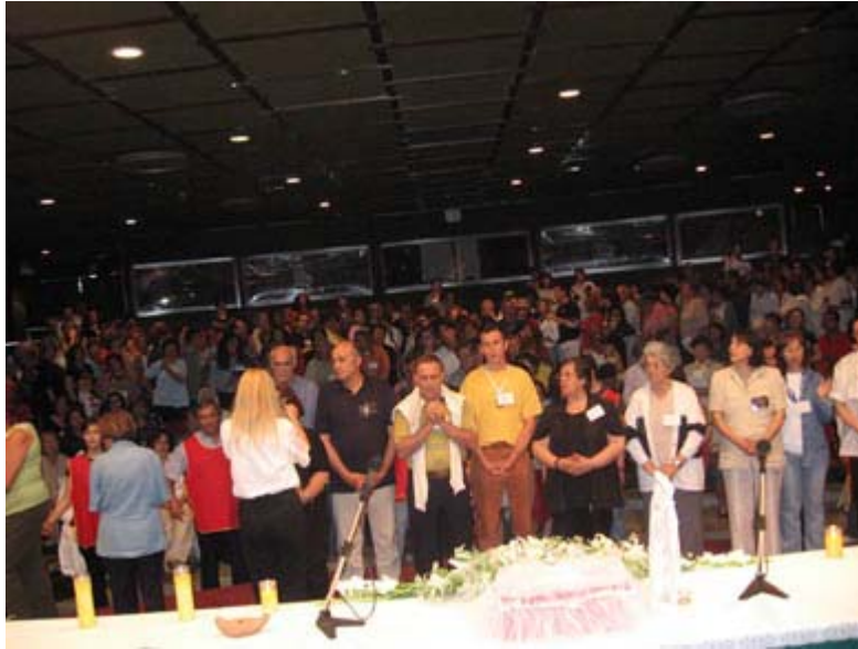
People lining up for Vassula to pray over them