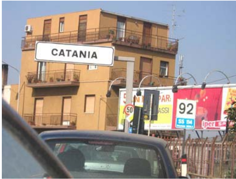
The city of Catania