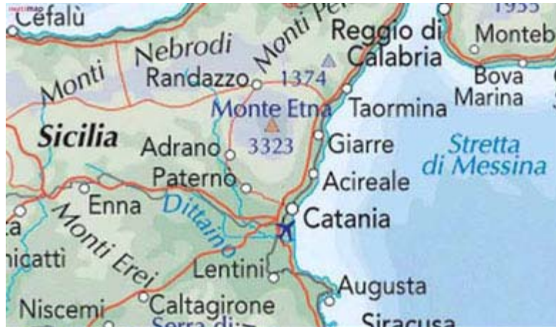
Map of Catania