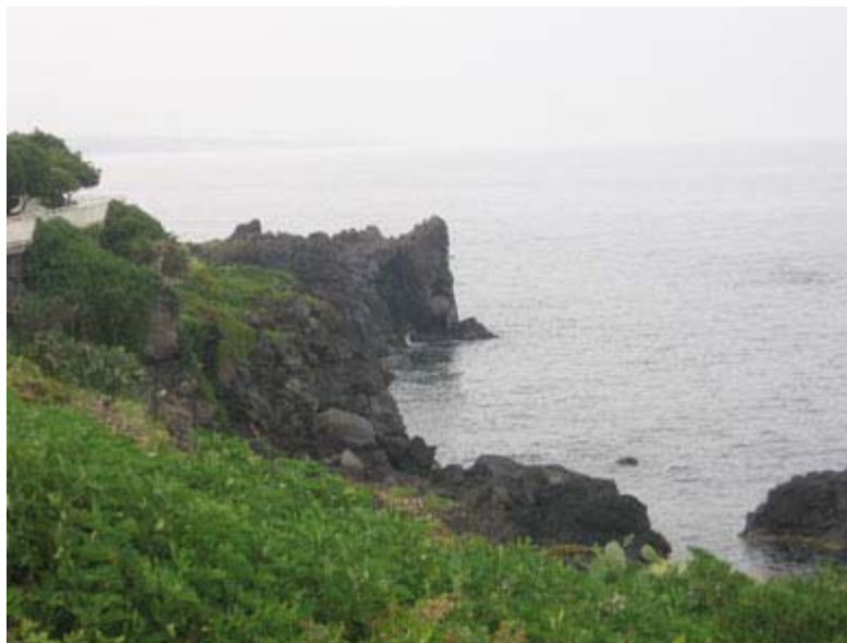
The lava in Catania