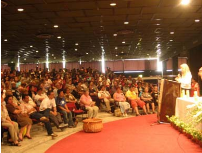
The Catania audience