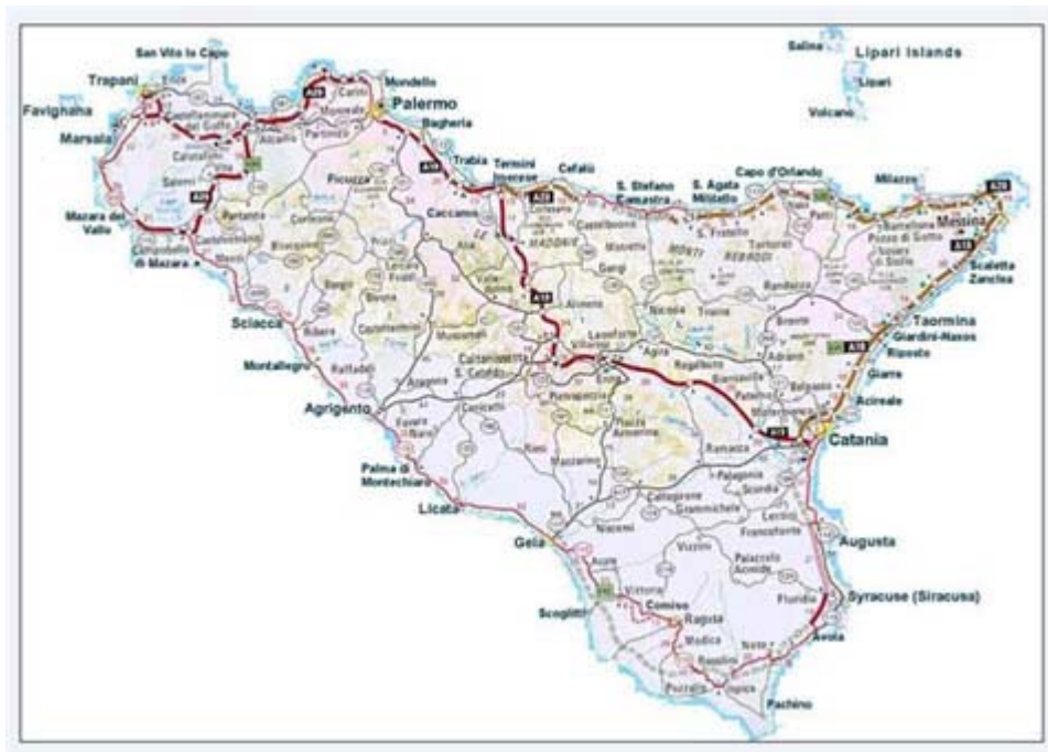
Map of Sicily, Catania on the East Coast