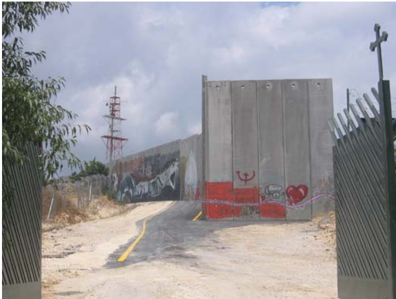
Wall in Bethlehem